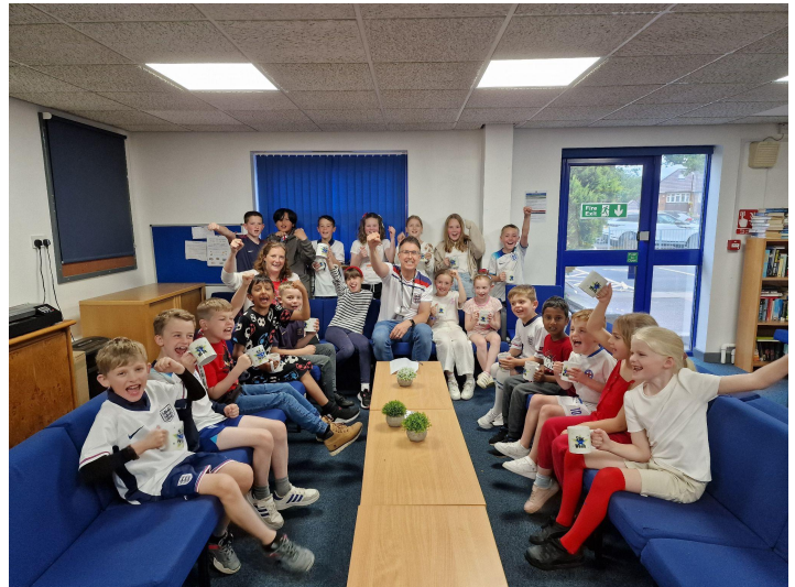
A sensible photo and a "Come On England" photo!